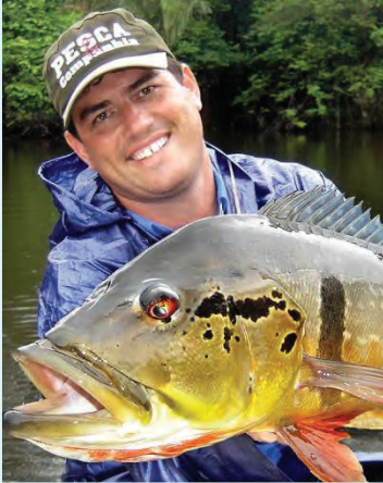
Trophy peacock bass are the norm when fishing aboard Yacht Tayacu.

While you might not find this operation featured during an ESPN Outdoors program or, perhaps, within the pages of your favorite fishing publication, many savvy American anglers have kept information about Yacht Tayacu to themselves for several years. This is a Brazilian owned operation with a "gringo" influence. The customer service and attention to detail by the owner, a world class angler himself, is second to none. Three varieties of peacock bass (barred, speckled and colorful butterfly) reside in the clear, blackwater rivers you will fishing, among a host of other feisty gamefish, and all will test your tackle and angling skills to the limit. Every cast in these tannin stained waters might yield a potential line class or all-tackle world record. In recent years, no international freshwater gamefish species has garnered the attention of the peacock bass. Many of our guest anglers had planned a once-in-a-lifetime trip to our camps for