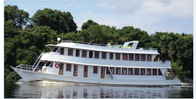
Yacht Tayacu on the Agua Boa River of Brazil

While you might not find this operation featured during an ESPN Outdoors program or, perhaps, within the pages of your favorite fishing publication, many savvy American anglers have kept information about Yacht Tayacu to themselves for several years. This is a Brazilian owned operation with a "gringo" influence. The customer service and attention to detail by the owner, a world class angler himself, is second to none. Three varieties of peacock bass (barred, speckled and colorful butterfly) reside in the clear, blackwater rivers you will fishing, among a host of other feisty gamefish, and all will test your tackle and angling skills to the limit. Every cast in these tannin stained waters might yield a potential line class or all-tackle world record. In recent years, no international freshwater gamefish species has garnered the attention of the peacock bass. Many of our guest anglers had planned a once-in-a-lifetime trip to our camps for